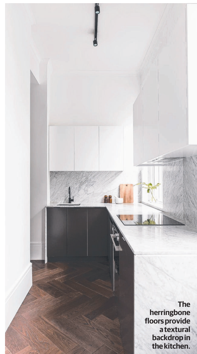
The herringbone floors provide a textural backdrop in the kitchen.